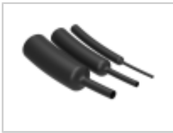
RNF-3000-18/6-2-70MM RNF-3000-24/8-2-40MM RNF-3000-6/2-9-40MM RNF-3000-18/6-0-45MM