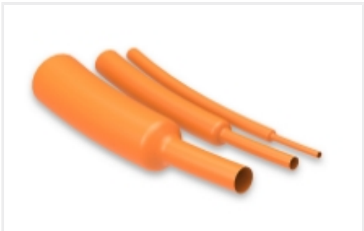
Orange Heat Shrink Tubing(11)