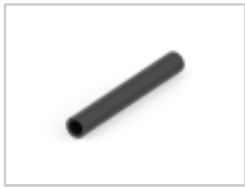
CRN-3/64-0-STK-CS34568 CRN-3/64-X-SP-CS34568 CRN-1/4-0-STK-CS34568 CRN-3/64-0-SP-CS34568