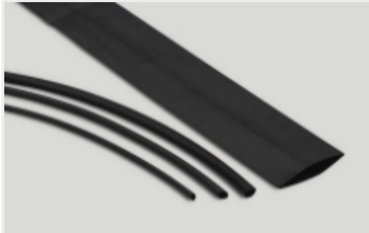
Single Wall Tubing(59)